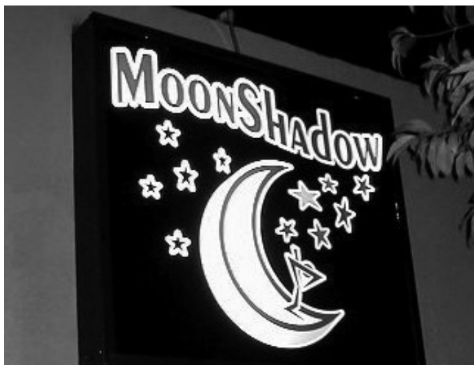
Where spacers go when they think they're being followed...